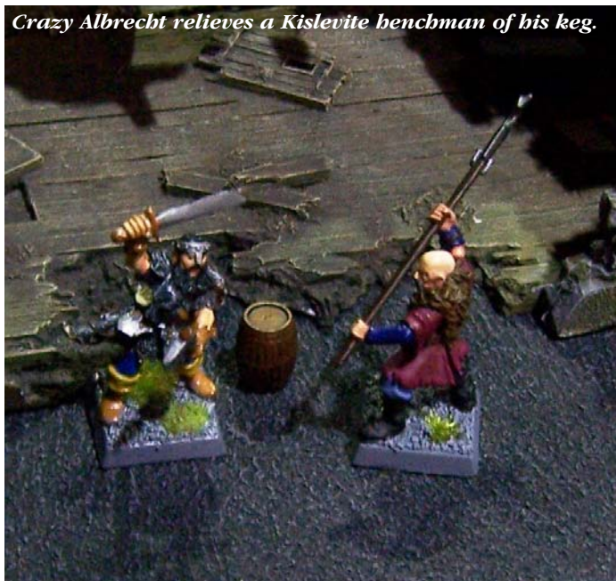
Crazy Albrecht relieves a Kislevite henchman of his keg.